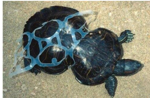
a terrapin trapped in a plastic six-pack carrier