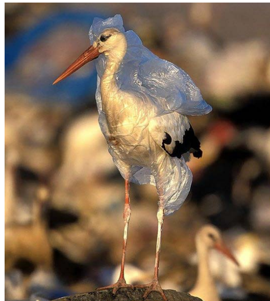
a stork entangled in a plastic bag

To save more wild lives, cut the circular loops of six-pack carriers before discarding, and use as few plastic bags as you can.